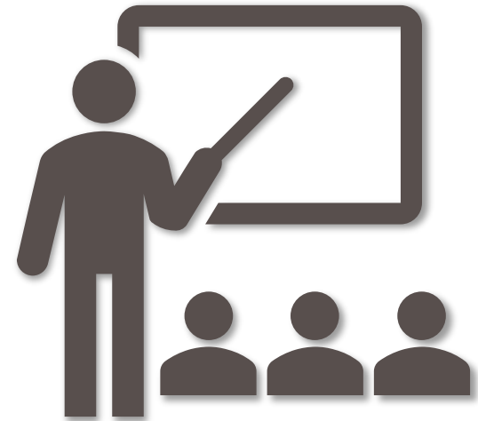
Virtual or in-person instructor-led classes