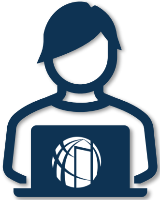
Online, self-paced courses

Different training needs = different learning formats. We bring the training to you.